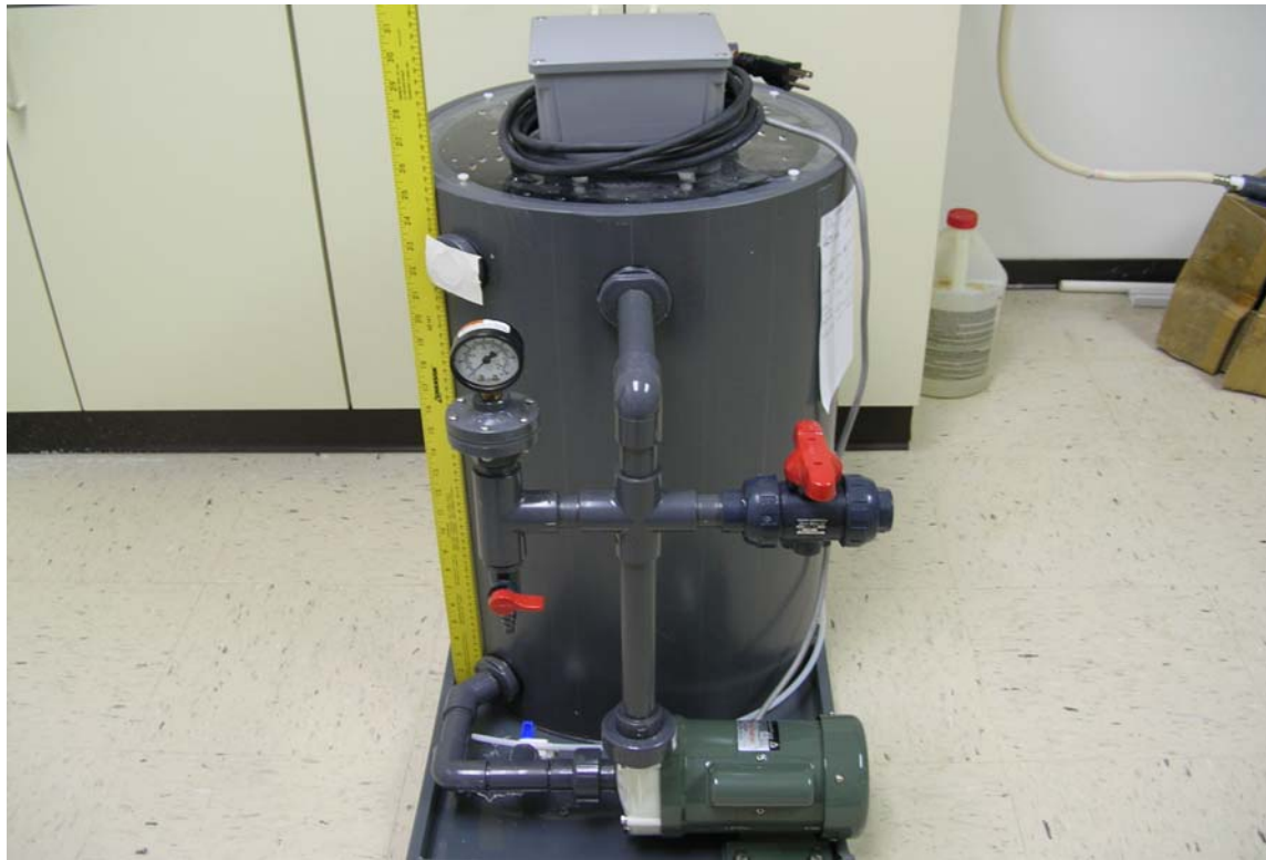
Motorized storage container for alkaline or acid solutions