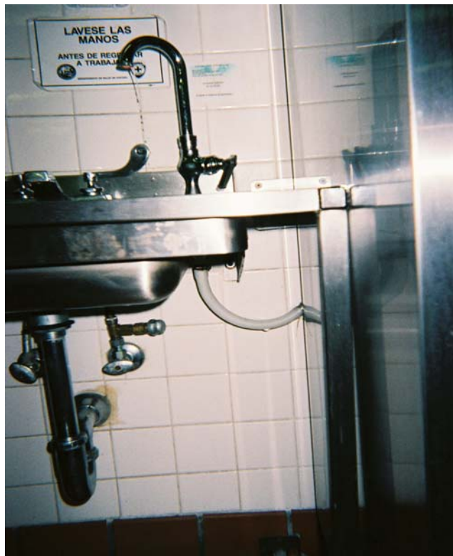
Food grade hose attached to storage tank or directly to ElectroCide System unit