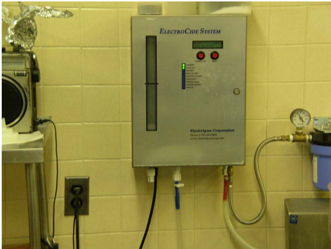
The ElectroCide System Electrolysis Unit

The following pictures illustrate some common installations that you may encounter.