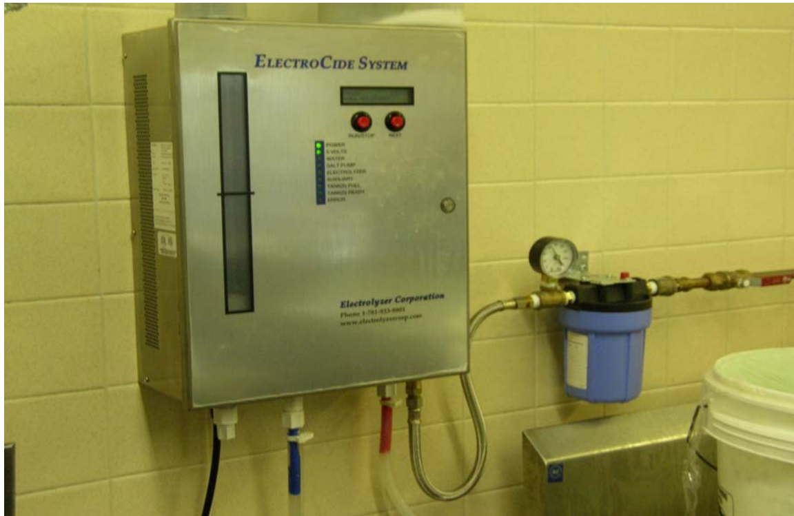
System with food grade hose dispensing into an equipment warewashing sink