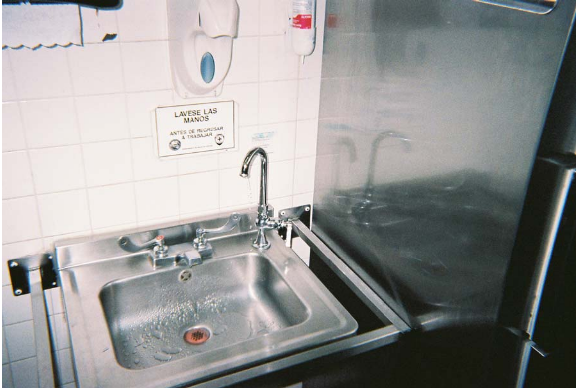
Hand sanitizing faucet at handwashing sink